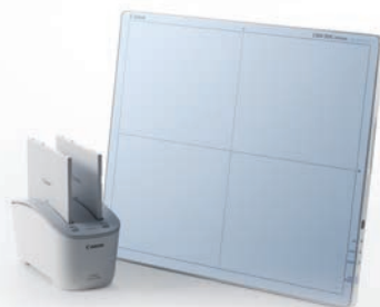
CXDI-701C Wireless (35x43cm)