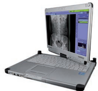
Portable DR Workstation