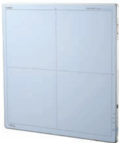
CXDI-401C Wireless (43x42cm)

Choose the DR Solution of the future and let our local, authorised Canon dealer advise you.