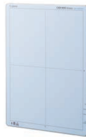
CXDI-801C Wireless (27x35cm)